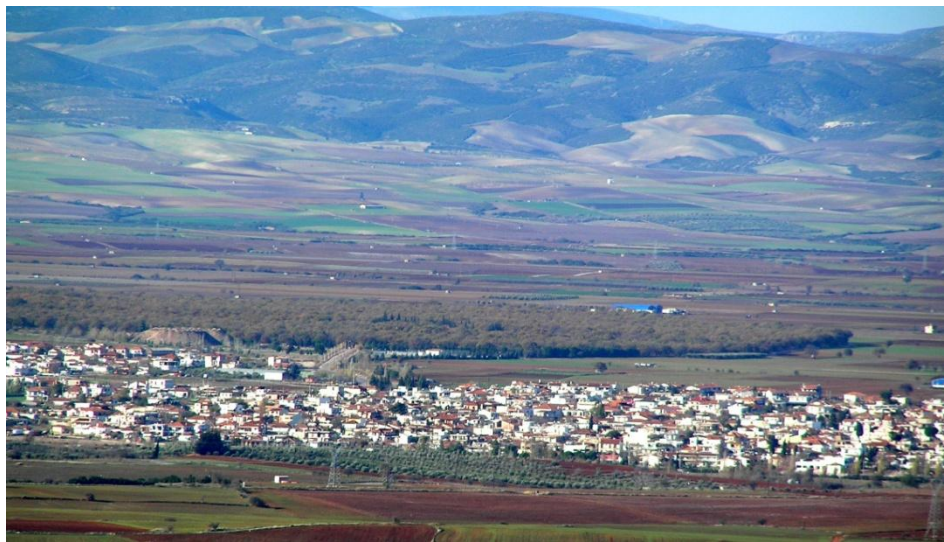
City of Almyros – Efxinoupolis General View