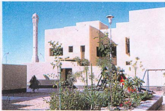
Residential cluster with playground