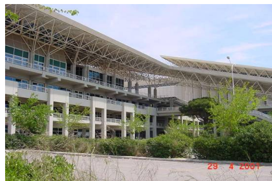
External view of the Arena

Great emphasis was put on the investigation of aspects of appearance of the areas surrounding the athletic installations, especially regarding the construction of overlays (various temporary structures) for Olympic use. Moreover, the study covered traffic management, access and parking areas, controlled internal circulation organization and design for both vehicles and pedestrians, as well as environmental considerations and corresponding appropriate measures for the various functions of the complex.