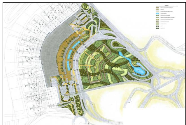
Parking Facility – Landscaping

The construction cost of the parking facility was estimated to 50 million euros