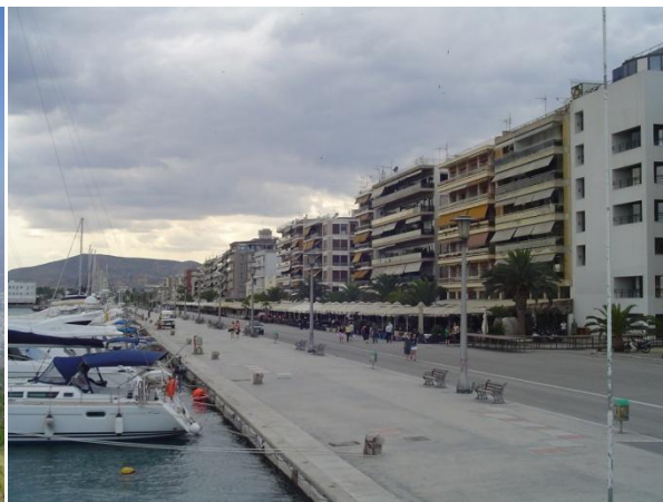
City of Volos: Seaside Urban Frontage and Marina