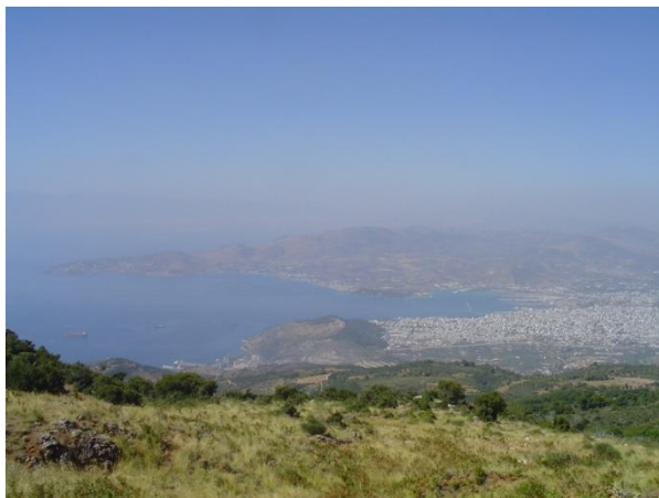
Study Area General View