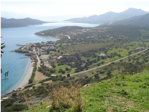
Study Area General View