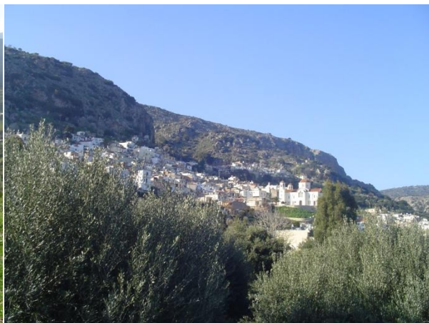
Kritsa traditional settlement