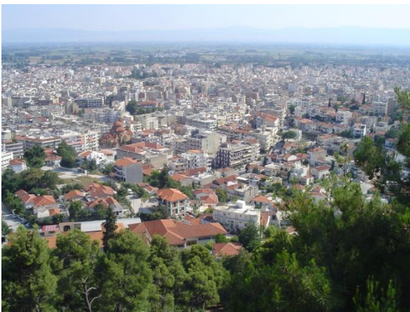
City of Serres