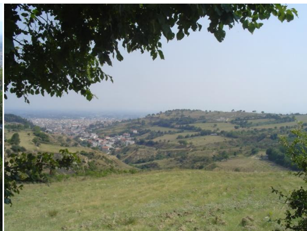
Study Area General View